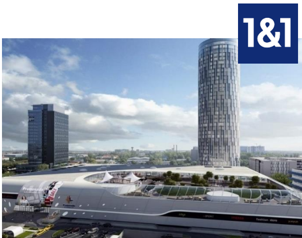
Project: SKYTOWER Surface: 3,500 sqm