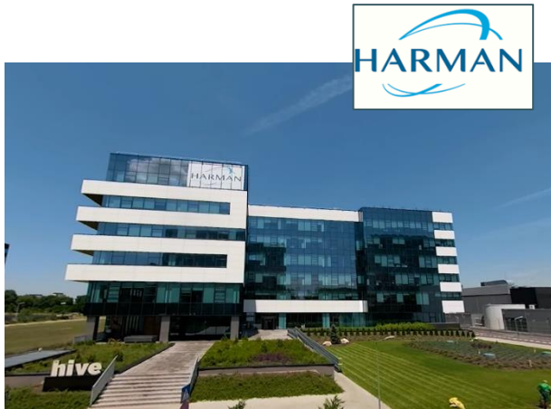
Project: METROFFICE Surface: 10,500 sqm