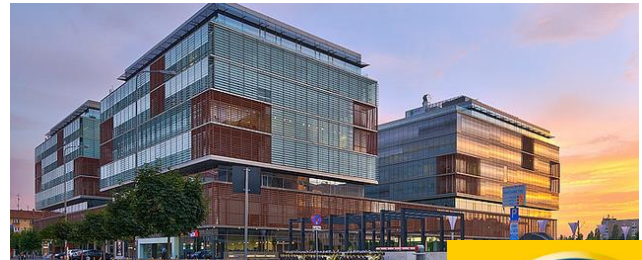
Project: CITY BC – Timisoara Surface: 4,000 sqm