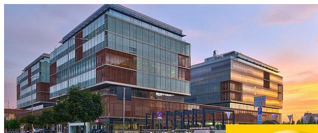
Project: CITY BC – Timisoara Surface: 4,000 sqm