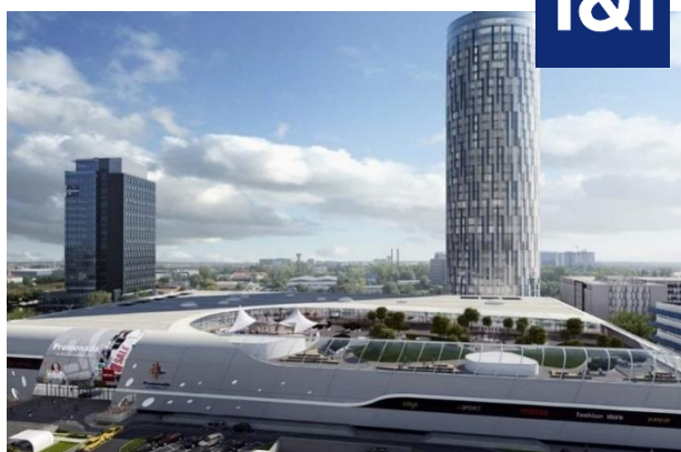
Project: SKYTOWER Surface: 3,500 sqm