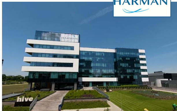
Project: METROFFICE Surface: 10,500 sqm