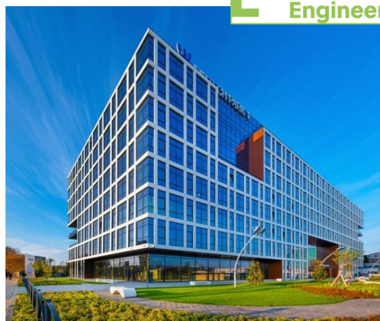
Project: AFI Tech Park Surface: 1,250 sqm