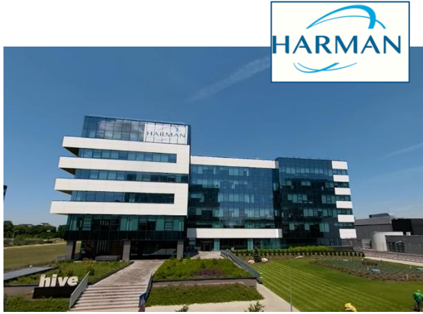
Project: METROFFICE Surface: 10,500 sqm