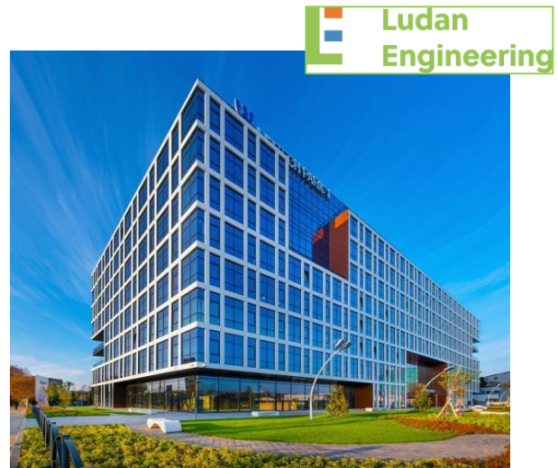
Project: AFI Tech Park Surface: 1,250 sqm